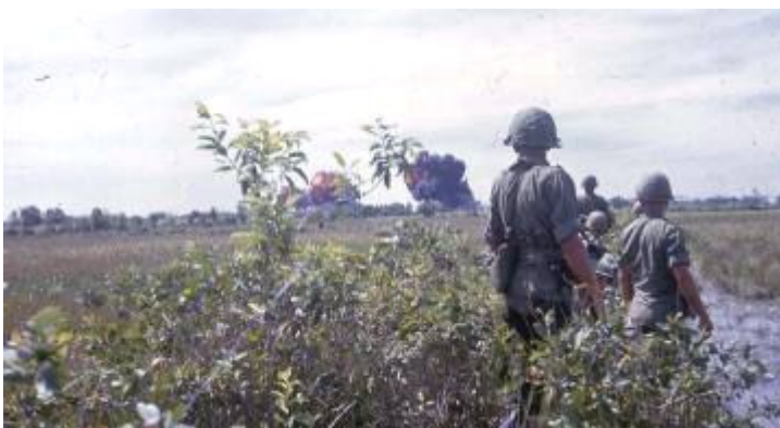
IHC troops watch air strike from paddy dike, 2 Jan 66.

On January 2d we had fought a day long battle, ending with our seizure of a dike line where the VC had been holding us up all day. That night the VC withdrew from the area. The next day, January 3d, we were given the mission to push on to the Vam Co Dong River, a few kilometers to the Southwest. We arrived at our objective in late afternoon, after crossing muddy fields and numerous canals up to our waists in muddy water. As we closed in on our objective, the companies were deployed into a perimeter and started to dig in. We set up the Battalion CP on a dike next to an abandoned sugar cane field, and I called for the company commanders to come to the CP for a meeting later in the afternoon.