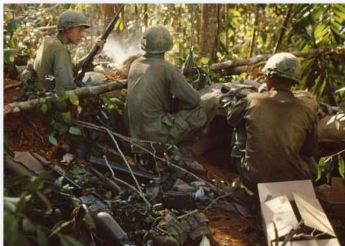
"Three soldiers of the 173d Airborne take a rest from their assault on Hill 875, near Dak To, Central Highlands. The 173d Airborne captured the hill on Thanksgiving Day 1967."