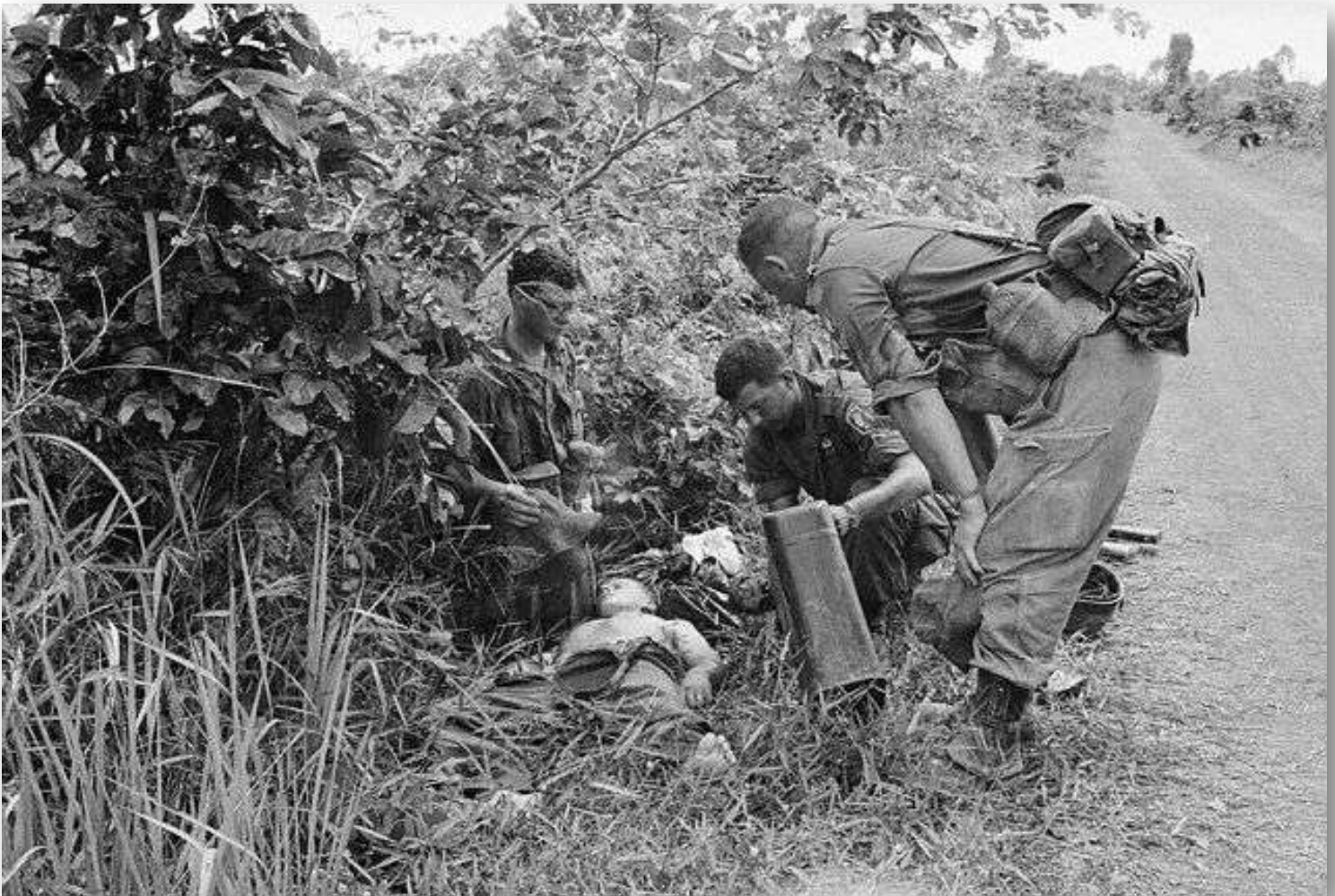
Sky Soldiers and Aussie troopers give aid to an Australian soldier during the first major joint-troop operation on 30 Jun 65.