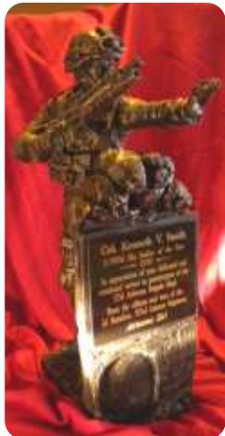
Presented to honoree