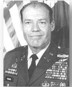
Col. Howard 7/11/39 – 12/23/09

The President of the United States in the name of The Congress takes pride in presenting the MEDAL OF HONOR to FIRST LIEUTENANT ROBERT L. HOWARD, UNITED STATES ARMY for service as set forth in the following CITATION: