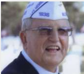
The Leapin' Deacon

"The revelation of God is whole and pulls our lives together. The signposts of God are clear and point out the right road. The life-maps of God are right, showing the way to joy. The directions of God are plain and easy on the eyes. God's reputation is twenty-four-carat gold, with a lifetime guarantee. The decisions of God are accurate down to the nth degree. God's Word is better than a diamond, better than a diamond set between emeralds. You'll like it better than strawberries in the spring, better than red, ripe strawberries."