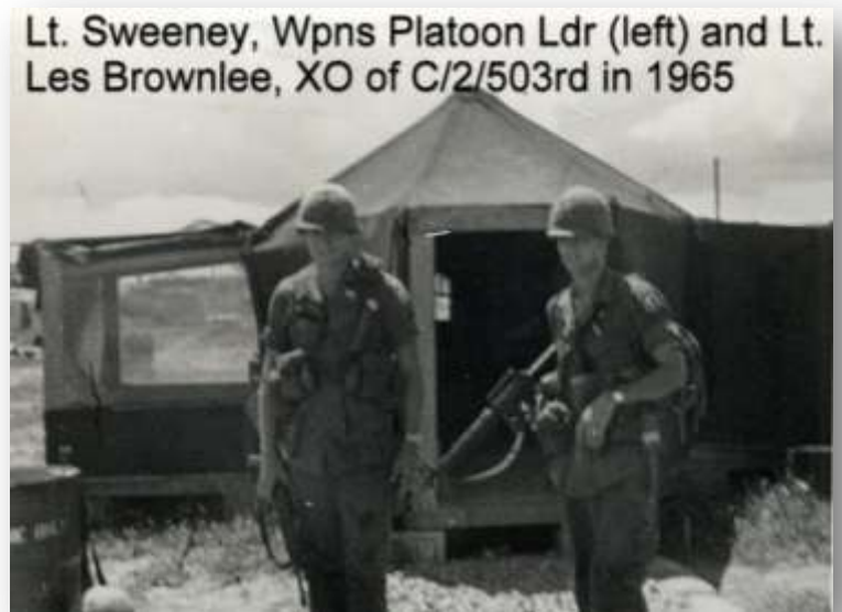
Survivors of Silver City