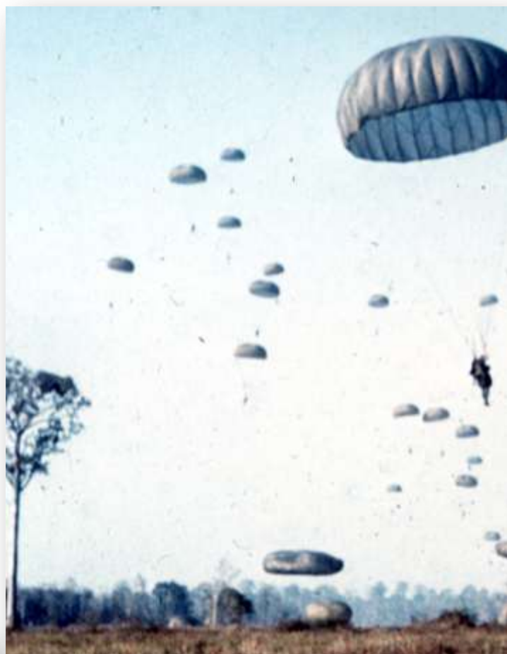
Jumpers, with the paratrooper caught in the treetop on the left of the photo.

The location of the DZ was so secreted, not even AF Blue Berets were given the location and the Air Force coordinator, LTC Burrows, jumped in at the same time as the rest of us. The AF presence was to coordinate the equipment and resupply drops. Some rumors dealt with how hot the DZ was and whether or not sniper fire or enemy activity was encountered. The paratrooper that landed in the tree and was stuck up there for several hours allegedly took periodic sniper fire.