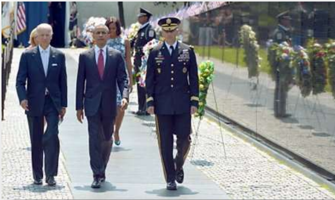
Memorial Day, 2012, at The Wall