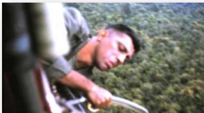
"This photo shows me in our chopper spraying Agent Orange. Hated to do this job, we had to fly slow for some reason. The pipe was right under my ass." Supply Trooper