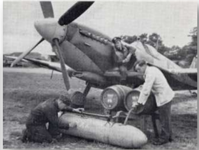
A staged shot of the Mod. XXX tank being filled.

The Spitfire had very little ground clearance with the larger beer kegs.