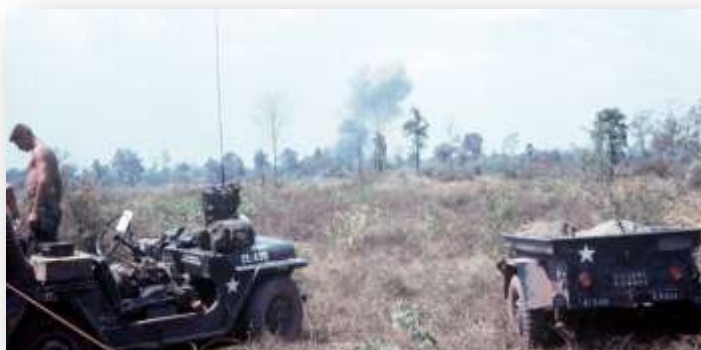
Smoke from a bomb dropped by a fighter jet.