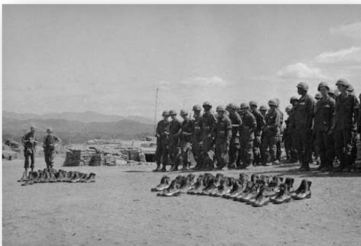
There were not enough boots.

Central Highlands, Dak To, Vietnam, November 1967, Battle for Hill 875