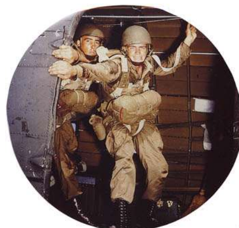
The reluctant paratrooper